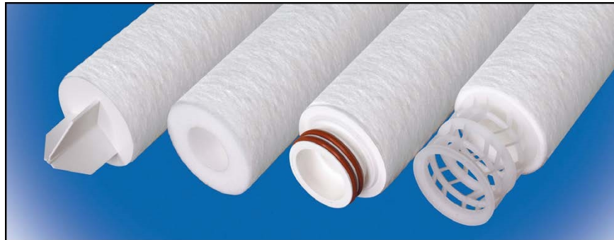
Flow Rate vs Pressure Drop

Westco's MBN Series melt-blown polypropylene cartridges are nominally rated and provide true depth filtration with a graded density design to maximize dirt holding capacity resulting in fewer change outs and lower differential pressures. Manufactured using 100% polypropylene polymer, the MBN Series is the ideal choice for your high purity applications. Manufactured through our exclusive process that thermally bonds the fiber matrix, the MBN Series optimizes fluid purity and eliminates foaming.